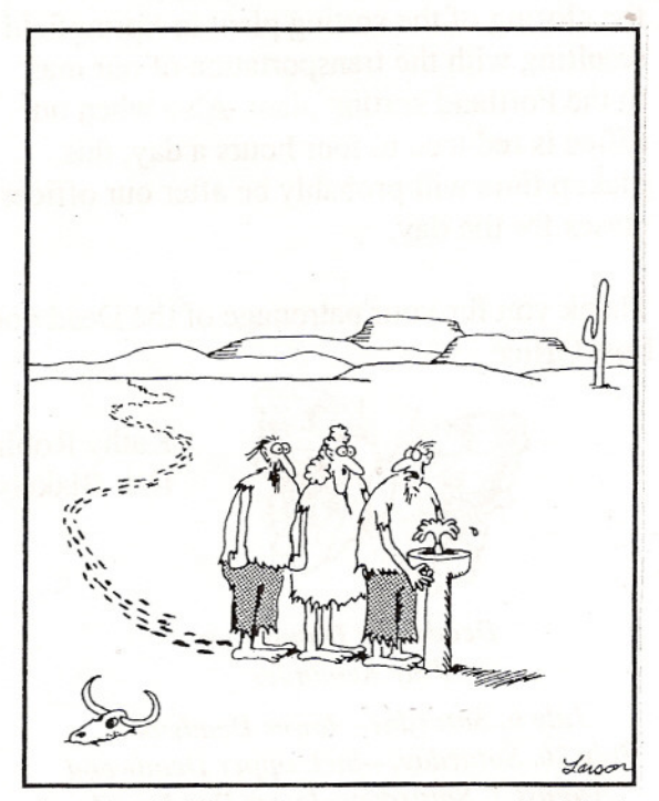
"Now just hold your horses, everyone. ... Let's let it run for a minute or so and see if it gets any colder."