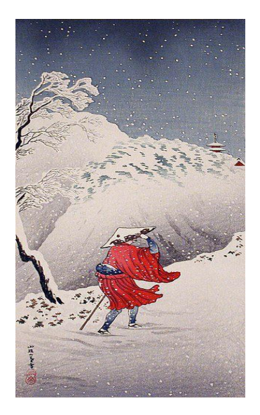
A White Sheet of Snow On which I write memories Of times long buried. Billy Burruss Submitted by Kaki Burruss