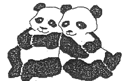
Earth Day – Every Day

For conference registration, please see http://90by30.com