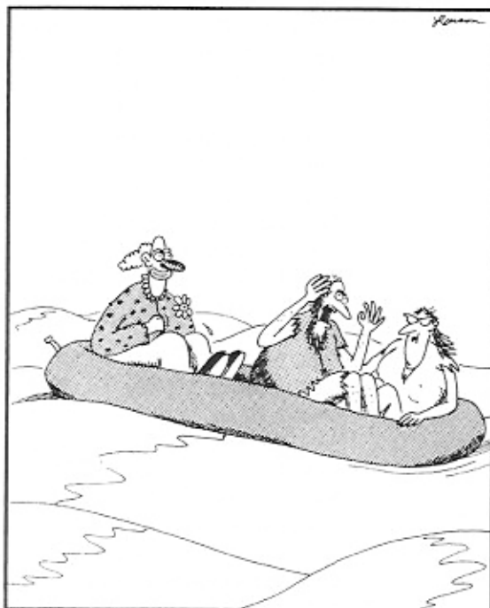
"There! I felt it again, Donna! ... Raindrops! Raindrops!"

Mondays--Al-Anon Meetings 6:30pm Call for location and/or info 964-3038